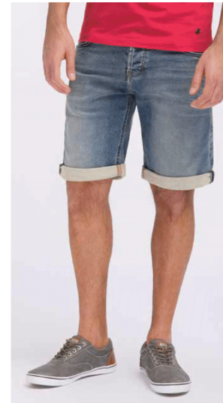
STYLE 1007754-5000-103 10 oz fashion knitted denim medium washed 83% CO | 15% PES | 2% EL

28 29 30 31 32 33 34 35 36 38 40 42 44 46