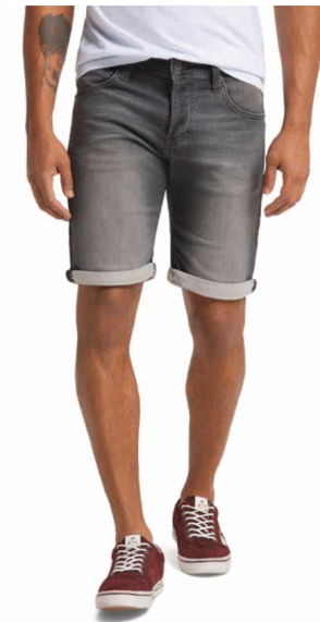
STYLE 1007755-4000-313 10,75 oz fashion black knitted denim medium washed 83% CO | 15% PES | 2% EL