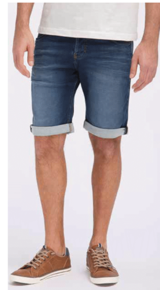
STYLE 1007754-5000-943 10 oz fashion knitted denim rinsed washed 83% CO | 15% PES | 2% EL