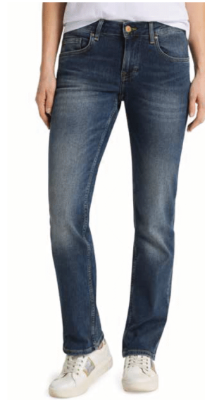
STYLE 0550-5032-582 11,5 oz special modern stretch denim rinsed washed 98% CO | 2% EL

● only available in styles 0550-5032-582