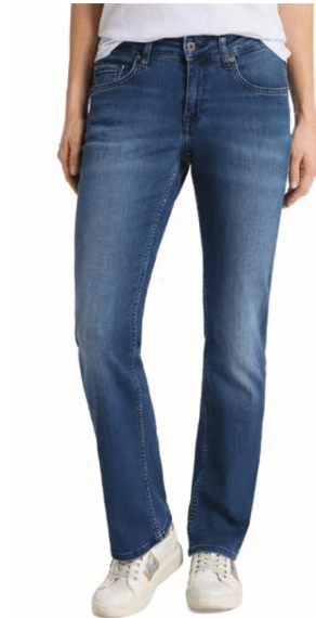
STYLE 1009319-5000-502 10,8 oz soft structured stretch denim medium washed 95% CO | 3% EME | 2% EL