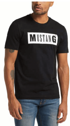
STYLE 1010372-4142 combed single jersey black | regular fit 100% CO S-XXXL