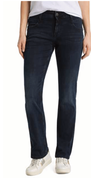
STYLE 1009315-5000-884 9,25 oz dual core power stretch denim stone washed 83% CO, 15% PES, 2% EL