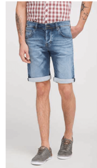
STYLE 1007754-5000-313 10 oz fashion knitted denim medium washed 83% CO | 15% PES | 2% EL