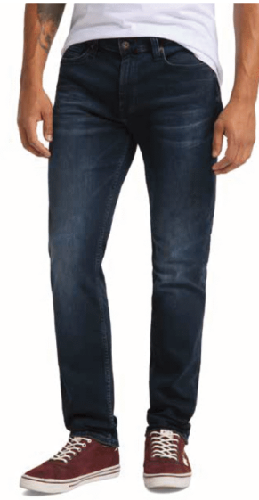
STYLE 1008948-5000-883 10,0 oz blue/black ultra jet denim stone washed 92% CO | 6% EME | 2%EL