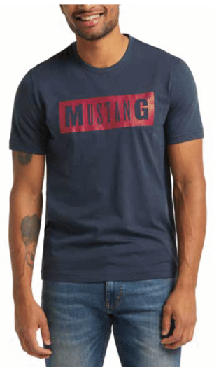
STYLE 1010372-4085 combed single jersey blue nights | regular fit 100% CO S-XXXL