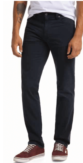
STYLE 1009074-4142 7,9 oz woven twill black 98% CO | 2% EL