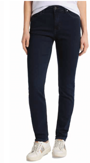
STYLE 1006275-5000-941 9,5 oz soft blue super stretch denim rinsed washed 74% CO | 22% PES | 4% EL