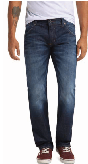
STYLE 3135-5111-593 11,0 oz heritage flat optic stretch denim rinsed washed 98% CO | 2% EL