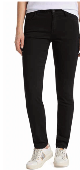
STYLE 0530-5575-492 9,5 oz soft black super stretch denim dark vintage 73% CO | 24% PES | 3% EL