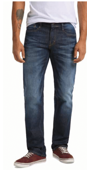
STYLE 3115-5111-583 11,0 oz heritage flat optic stretch denim stone washed 98% CO | 2% EL