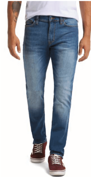
STYLE 1008949-5000-783 9,75 oz ultra fit denim stone washed 92% CO | 6% PES | 2%EL