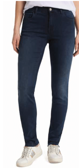
STYLE 0530-5574-070 9,5 oz soft blue super stretch denim stone washed 74% CO | 22% PES | 4% EL

• only available in style 0530-5574-070 & 0530-5575-492