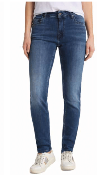
STYLE 1009317-5000-502 10,8 oz soft structured stretch denim medium wash 95% CO | 3% EME | 2% EL