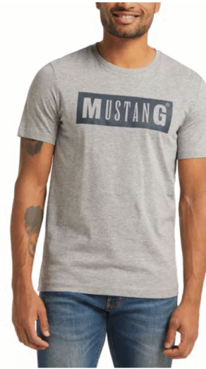
STYLE 1010372-4140 combed single jersey mid grey melange | regular fit 85% CO | 15% CV S-XXXL