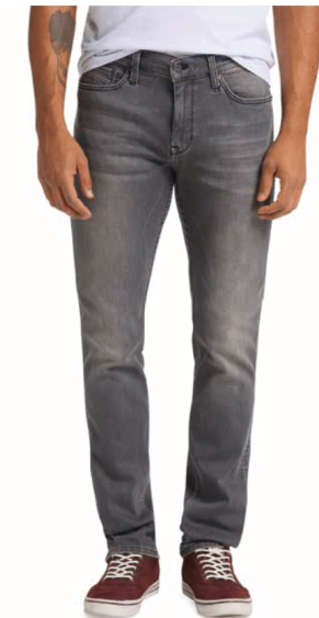
STYLE 1010574-4500-883 11 oz ultra jet grey denim stone washed 92% CO | 6% EME | 2%EL