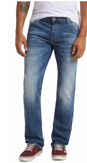
STYLE 3135-5111-583 11,0 oz heritage flat optic stretch denim stone washed 98% CO | 2% EL