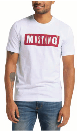
STYLE 1010372-2045 combed single jersey general white | regular fit 100% CO S-XXXL